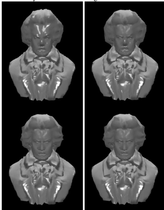
Fig. 2. Multi-resolution result.

try image (J2K) file size is 105KB. Fig. 2 shows the multi-resolution result. With the multi-layer JPEG 2000 image, we can see the model being rendered in greater details as more data received by the client as time goes.